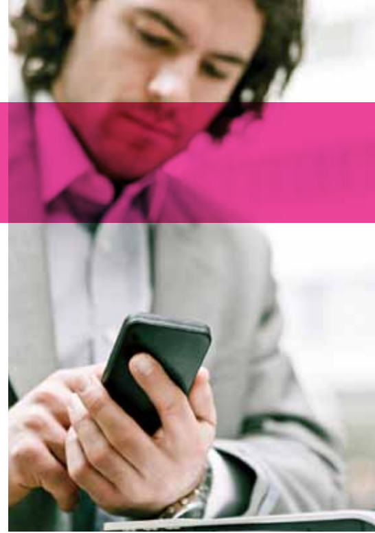
Figure 1. Alcatel-Lucent Office Communication Solutions portfolio

The portfolio is reliable, open and standards-based. Alcatel-Lucent Office Communication Solutions are modular at every level — from communication suites and software licenses to communication servers and networking infrastructure that meet customers' exact requirements. You can buy the portfolio with a hardware warranty and a variety of services, evolving from a simple maintenance contract to a complete system with new applications and technology. Alcatel-Lucent Office Communication Solutions are future-ready, based on an IP communication server using standard protocols and offering a number of powerful features.