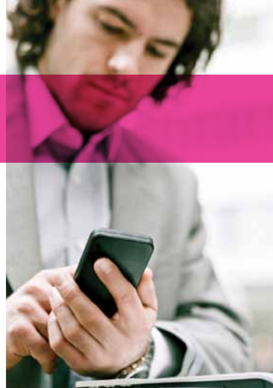
Figure 1. Alcatel-Lucent Office Communication Solutions portfolio

The portfolio is reliable, open and standards-based. Alcatel-Lucent Office Communication Solutions are modular at every level — from communication suites and software licenses to communication servers and networking infrastructure that meet customers' exact requirements. You can buy the portfolio with a hardware warranty and a variety of services, evolving from a simple maintenance contract to a complete system with new applications and technology. Alcatel-Lucent Office Communication Solutions are future-ready, based on an IP communication server using standard protocols and offering a number of powerful features.